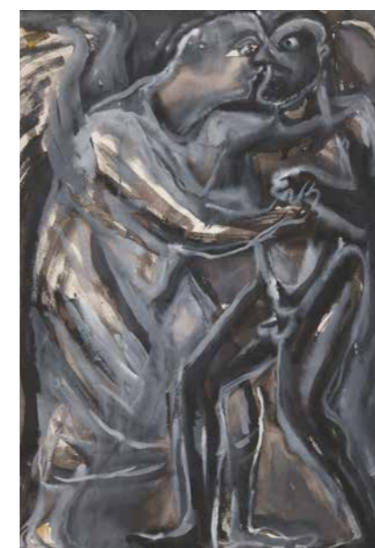
Judit Reigl Jacob Wrestling with the Angel (Two Men) , 1947 Hungarian National Gallery - Museum of Fine Arts, Budapest