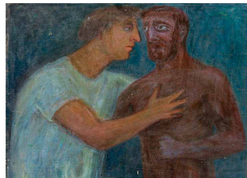
Judit Reigl Jacob Wrestling with the Angel (Friends) , 1947 Hungarian National Gallery - Museum of Fine Arts, Budapest