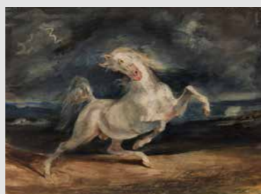
Eugène Delacroix Horse Frightened by Lightning , 1825-1829 Museum of Fine Arts, Budapest

The presentation features a movie with footage of the artist in her studio working on Dance of Death , interspersed with images of all the drawings of the series. In them, Reigl repeatedly recalls pieces by Courbet, Leonardo, Delacroix, Fra Angelico, Cranach, Dürer, Gaddi, Goya, El Greco, Hans Baldung Grien, and other masters whose works she first admired in the museum during her student years. After viewing the installation in the Michelangelo Hall, visitors will have a fresh view of many of the masterpieces in our Permanent Collection.