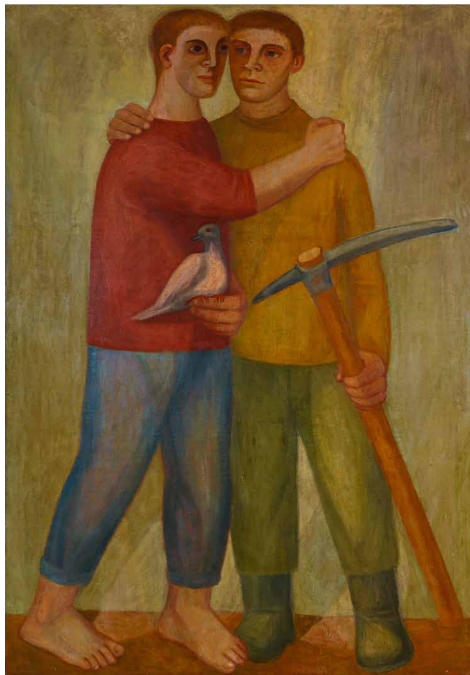
Judit Reigl Worker-Peasant Friendship , 1948 Janos Gat Gallery