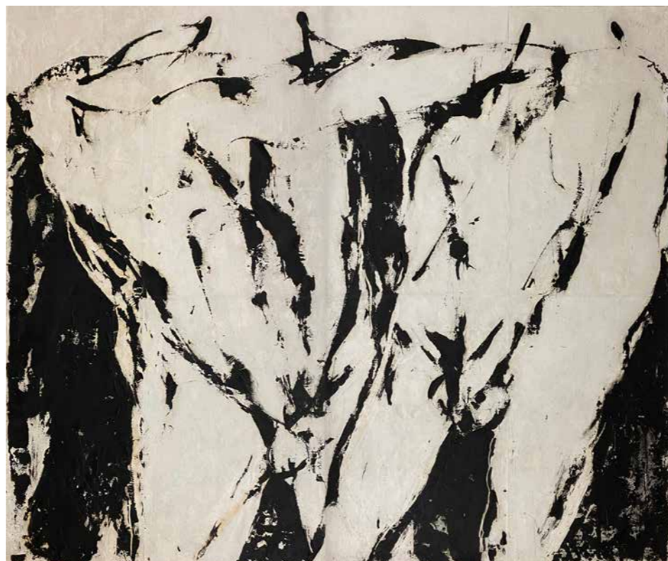
Judit Reigl Wrestlers , 1966 Musée Maillol, Paris