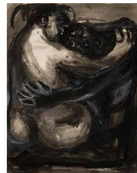
Judit Reigl Jacob Wrestling with the Angel (Embrace) , 1947 Hungarian National Gallery - Museum of Fine Arts, Budapest