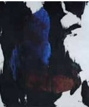
Mass Writing , 1961, oil on canvas. Collection of the artist © Judit Reigl