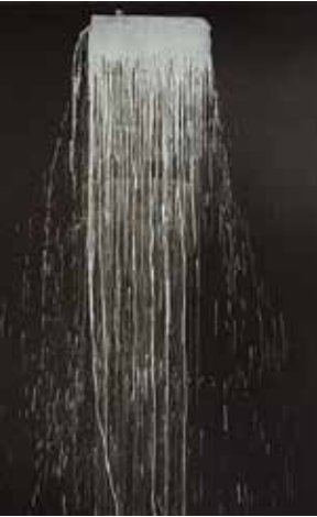
American artist Pat Steir executed the painting Tall Waterfall from 1990 to 2011.

The work is displayed in the West Ambulatory.