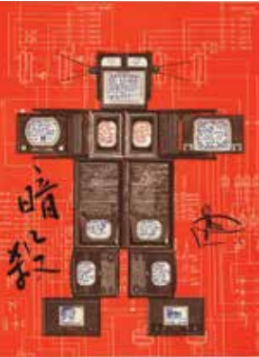
Nam June Paik's 1989 print Marat is now on view in the Stern Gallery. Ruth C. Rush Contemporary Art Fund, 2014.61

INSTALLATIONS OF ASIAN ART THROUGHOUT THE MUSEUM have been updated with new works or new audio recordings. Psycho/Somatic: Visions of the Body in Contemporary East Asian Art continues with a new rotation of works on paper, including Liú Bólin's large photograph Hiding in the City No. 88-Sawmill and Nam June Paik's print Marat from his series Evolution/Revolution/Resolution .