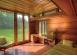
View from one of the bedrooms in the Weltzheimer-Johnson House.

Oberlin's Frank Lloyd Wright house will reopen on Sunday, April 3, from noon to 5:00 p.m. Additional open houses are scheduled for May 1, June 5, July 3, August 7, September 4, October 2, and November 6. Presentations on the architecture and history of the house begin on the hour. Admission is $5.00 per adult. College students and children under 18 are admitted free.