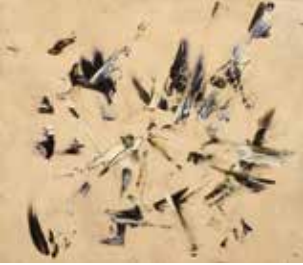
Outburst , 1956, oil on canvas. Metropolitan Museum of art, gift of the artist, 2009.165